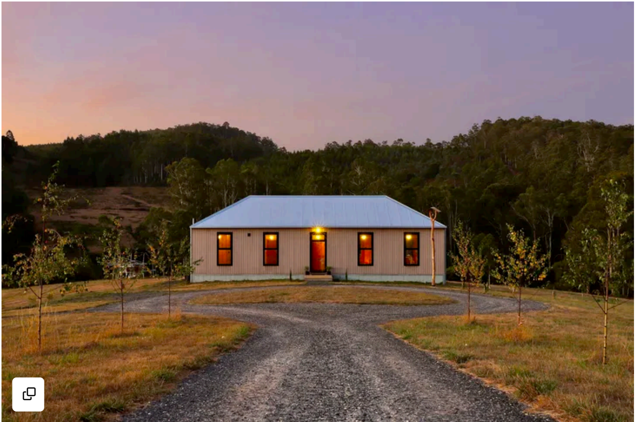
Lev’s campaign to improve housing and planning includes establishing guidelines for a minimum aesthetic standard that champions local character and craft.

According to Lev, this development of aesthetic guidelines “must be done professionally through a collaborative process and with much public consultation. It won’t happen overnight, but we must make a start before we lose even the last remnants of our uniquely Australian building culture to globalised anonymity.”